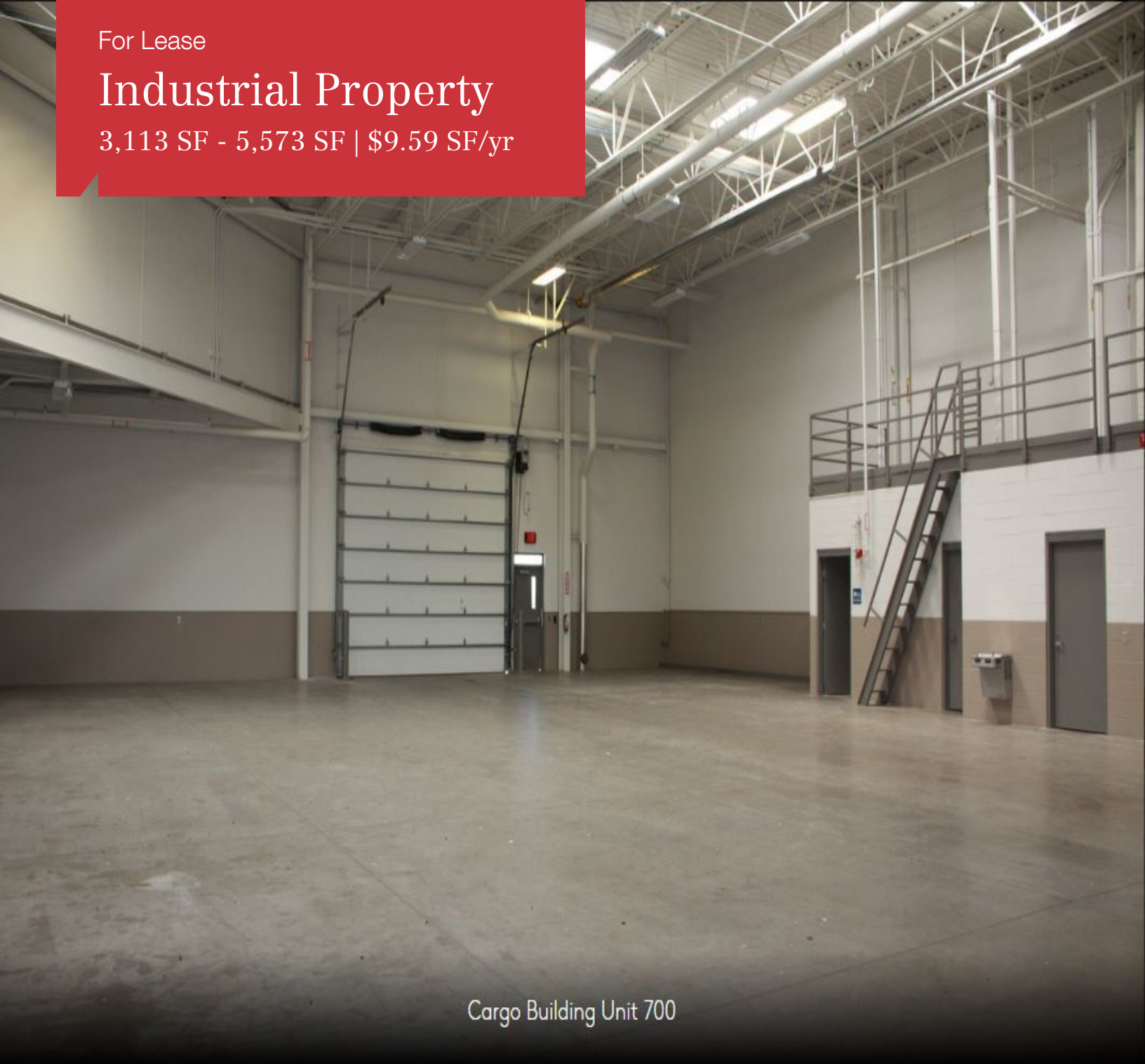
Cargo Building Unit 700