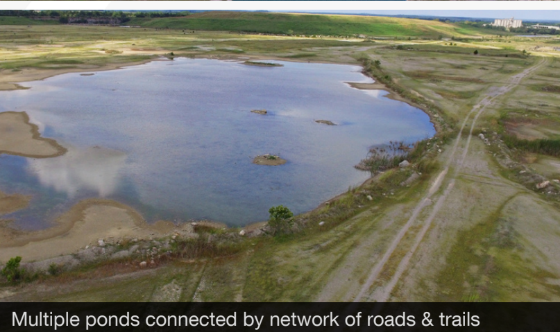
Multiple ponds connected by network of roads & trails