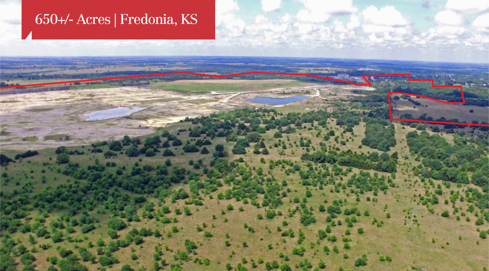
Looking Southwest | 258 Acres of Grazing Land