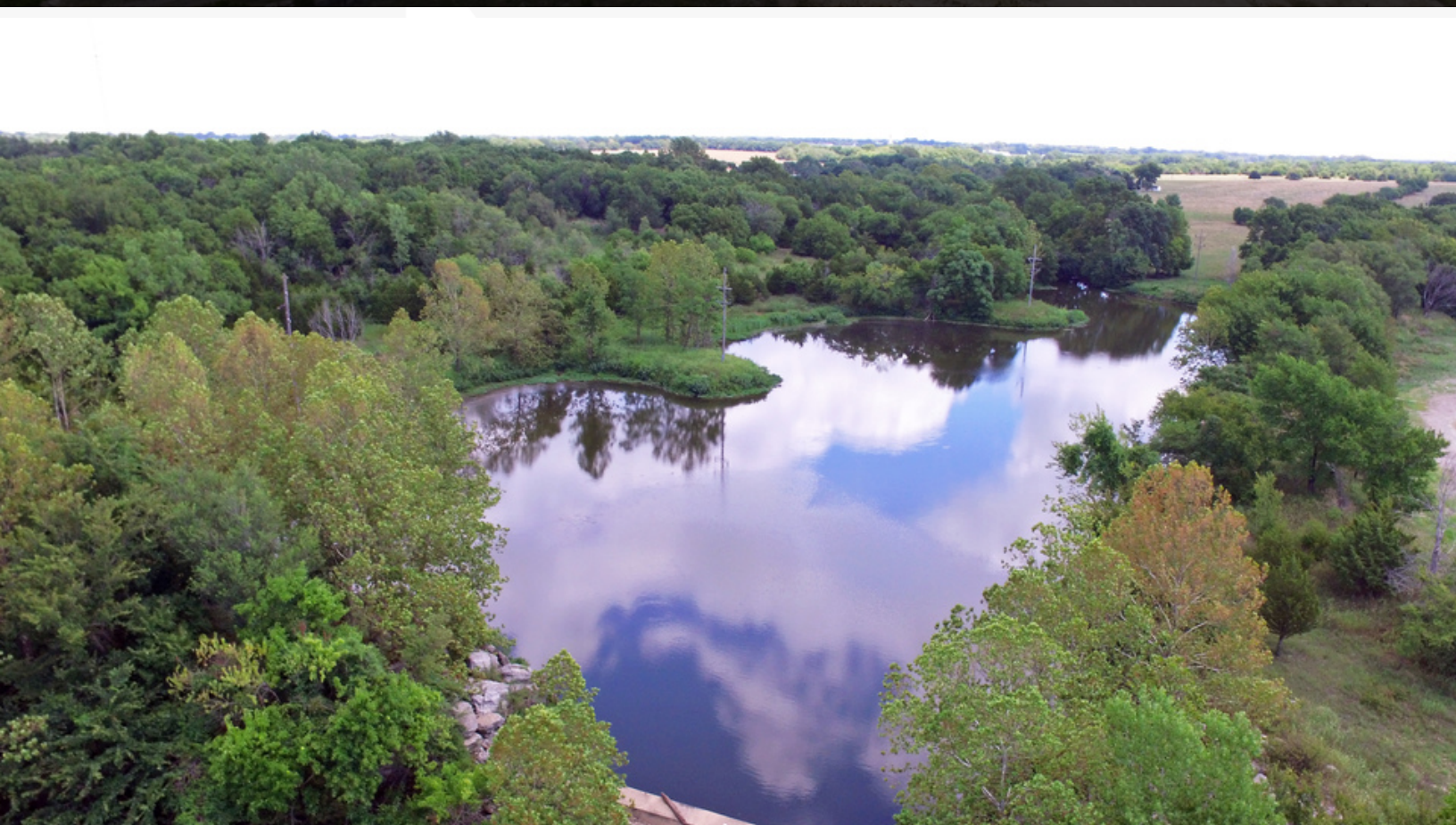
Tree-lined pond along north end of property