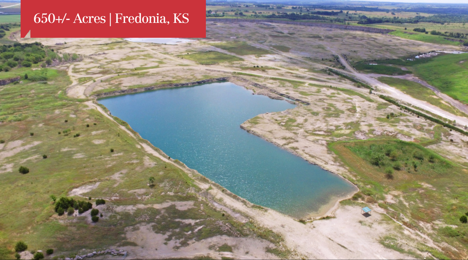
Clear rock-bottom pond - 35 feet deep