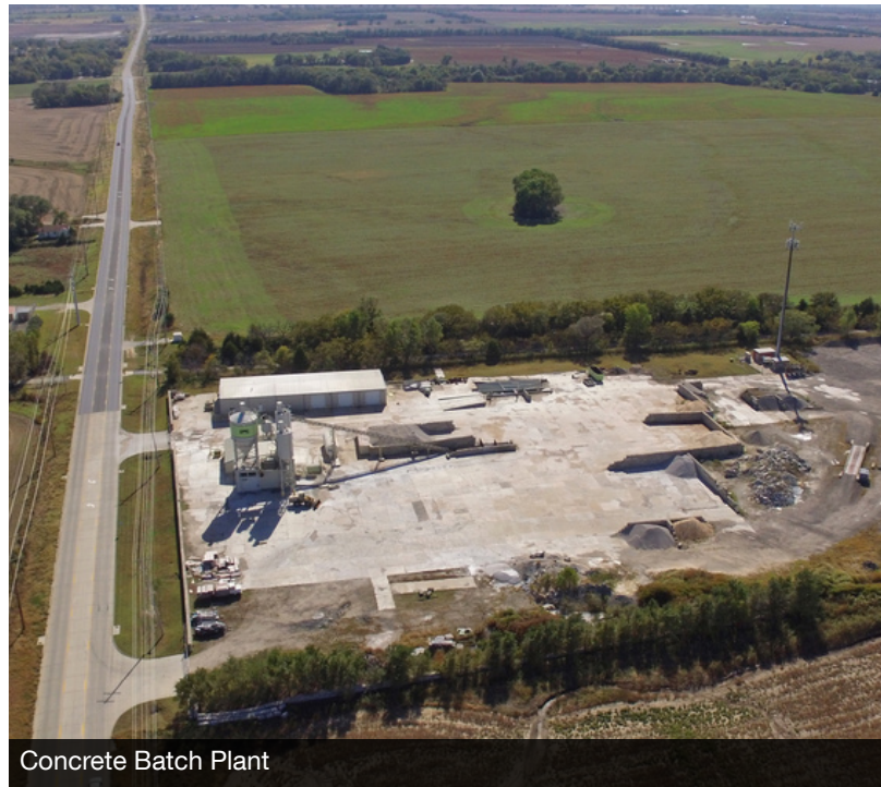
Concrete Batch Plant