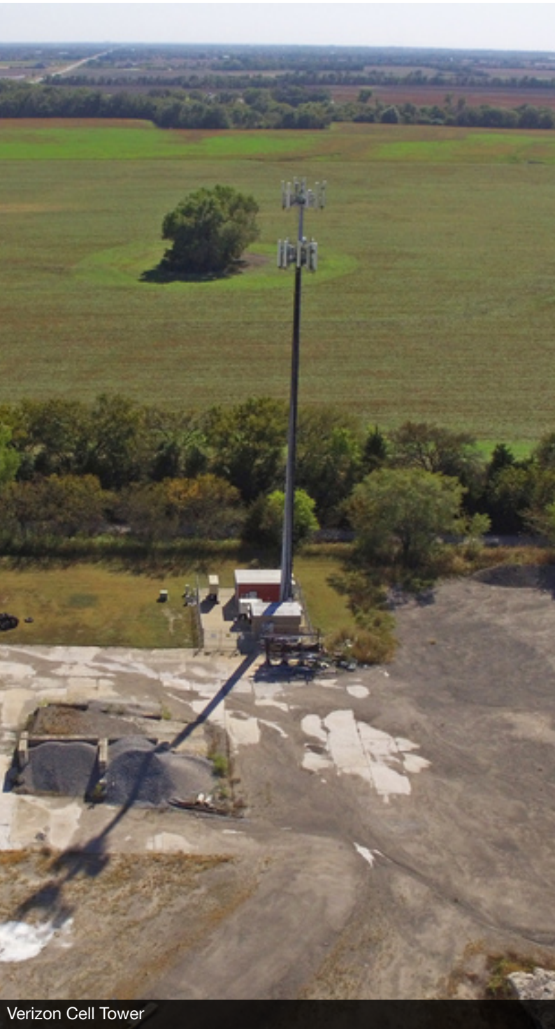
Verizon Cell Tower