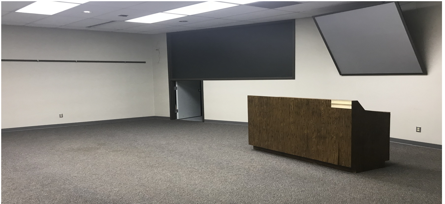
Former Aviation Training Room